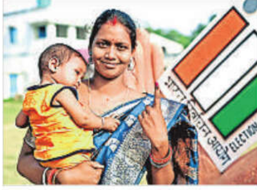
झाड़ग्राम में मतदान करने के बाद अभिष्ट स्थाई दिखाती महिला।

कूच बिहार में टाउन हाई स्कूल के बूथ नंबर 229 पर मतदान लगभग एक घंटे तक स्थगित रहा। झाड़ग्राम जिले में एक केंद्र के पास एक हाथी के घूमने के कारण मतदाताओं में दहशत फैल गई।